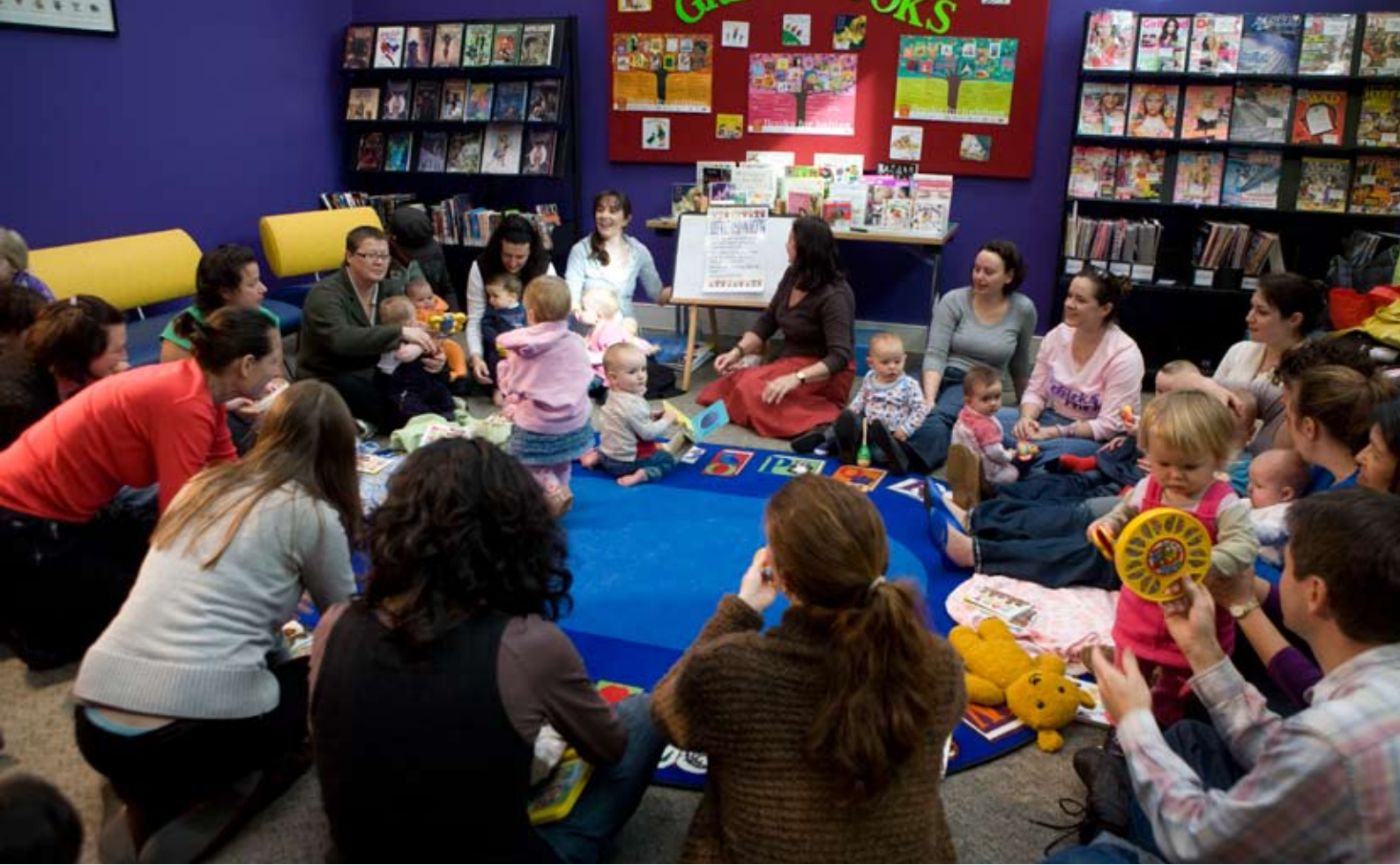
A Better Beginnings session at AH Bracks Public Library