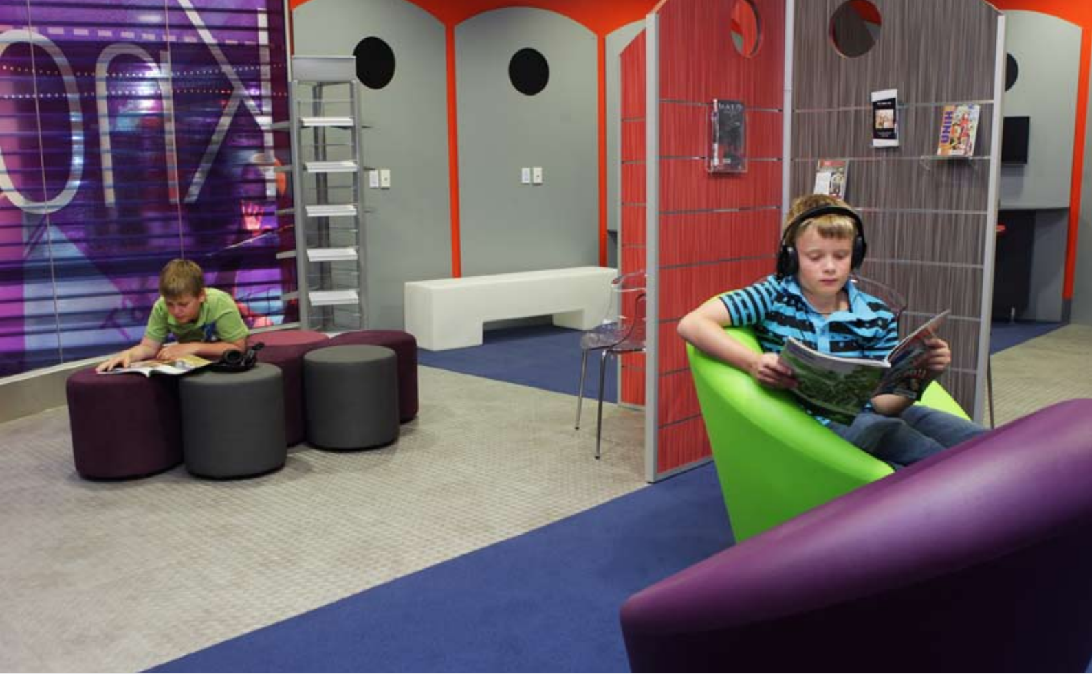
Armadale Public Library