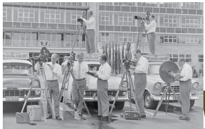
Empire Games media pack, Perry Lakes Stadium, 1962

For bookings and enquiries contact the Education Officer on 9427 3202. We strongly advise all school groups to contact the State Library prior to their visit, even if a guide or other educational services are not required.