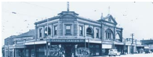
State Theatre, Mount Lawley 1938

To read the full evaluation Making A Difference: a report on the Evaluation of the Better Beginnings Family Literacy Program 2007-2009 , go to www.better-beginnings.com.au